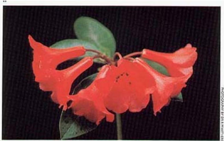
Above R. lochiai , collected at Thornton Peak, Queensland. See page 5.