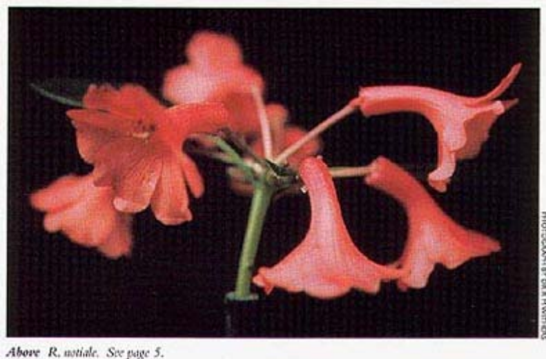
Above R. ustiale . See page 5.